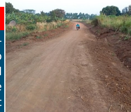
The same road after works had started costing 2.5m on 30th/November / 2018.

Following these interventions, We would like to appreciate the role played by all the different stake holders in ensuring that this road was worked on.